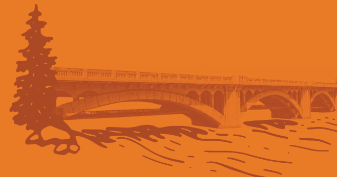
Centre Street Bridge Year of Construction: 1915 Address: 118 Riverfront AV SE