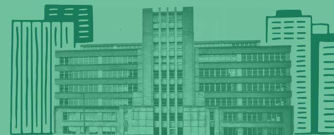
Barron Building Year of Construction: 1951 Address: 610 8 AV SW