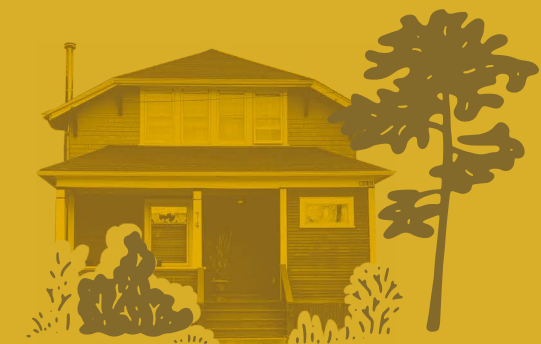
Brady Residence Year of Construction: 1911 Address: 74 New ST SE

NEW HISTORIC RESOURCES ADDED TO THE INVENTORY